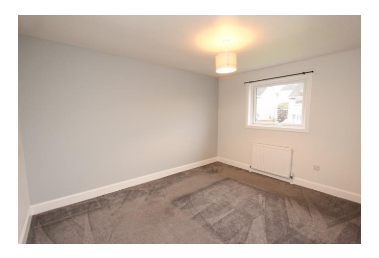
BEDROOM 3: A further bedroom to the front with CH radiator.